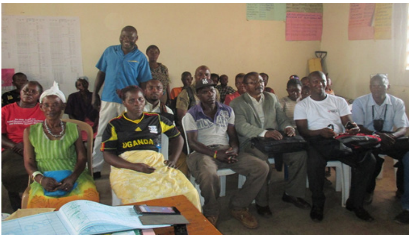
PSPP TEAM AT KALIMALI SETTLEMENT FORUM MEETING

FedURP and FESDA could therefore be a starting point to develop a system of hierarchical forums that will act as engines for inclusive development planning.