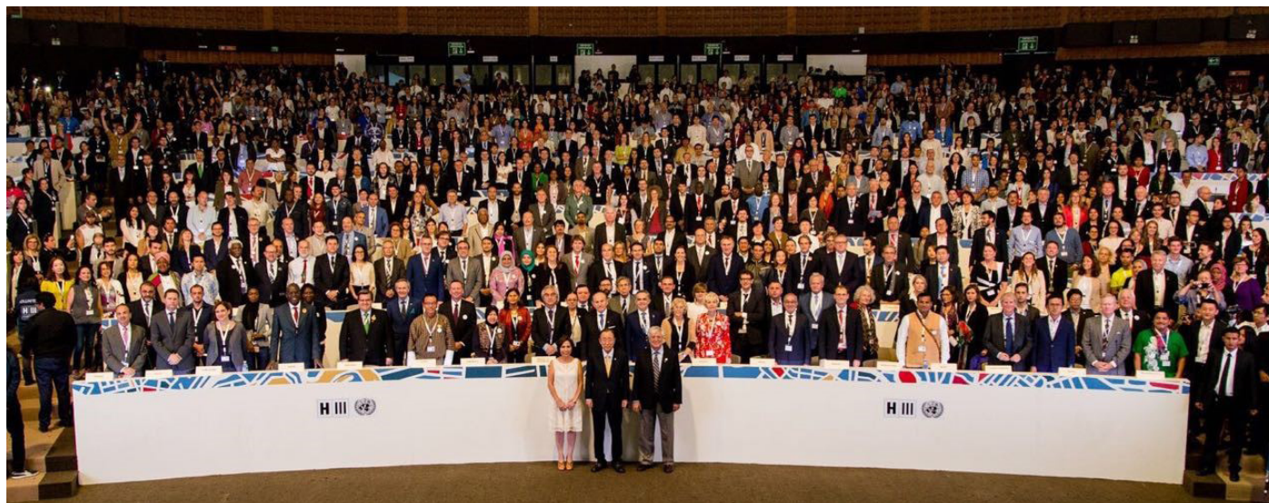
HABITAT III CONFERENCE DELEGATES, 2017

'By 2050 the world urban population is expected to nearly double, making urbanisation one of the 21st century's most transformative trends'. (Quito Declaration on Sustainable Cities and Human Settlements for All, October 2016).