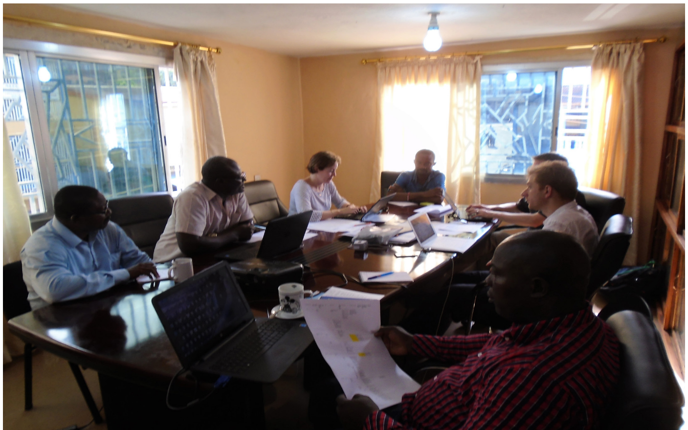
FIRST DAY OF DISCUSSION — AGREEING ON THE RESEARCH AGENDA AND METHODOLOGY

On a similar note, the PSPP partners collaborate with each other and with other development partners working in informal settlements. This collaboration could be enhanced with an urban development forum that will include all development partners and stakeholders for urban development. This development forum formation is one of the PSPP partners' collaboration plan activities. It could form the starting point of city and nationwide forums with the involvement of all development stakeholders.