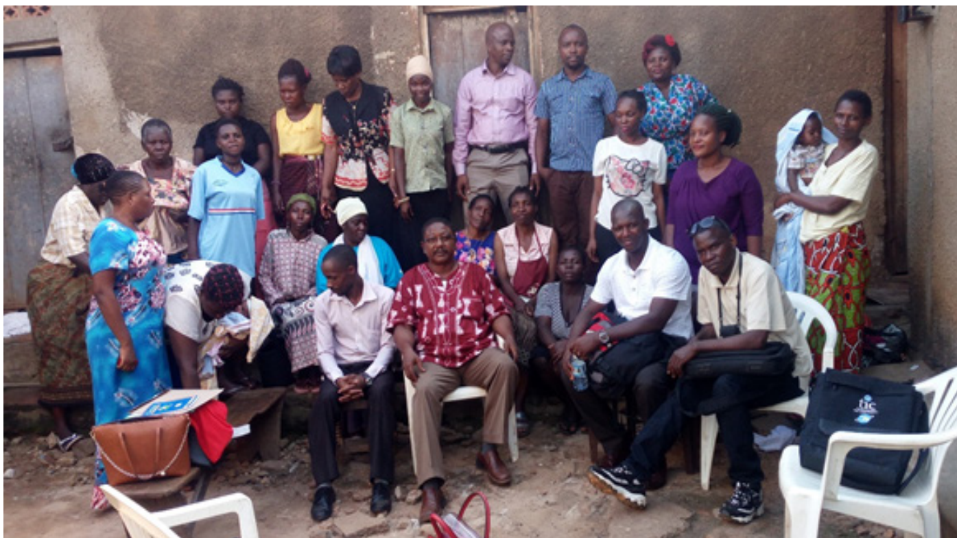
PSPP TEAM WITH A HOUSING COOPERATIVE GROUP AFTER ATTENDING THEIR MEETING

PSPP partners have established informal settlements dwellers' forums that operate in the west and east of Freetown. On one hand, the Federation of Urban and Rural Poor (FedURP) operates mostly in the western part of Freetown with ongoing efforts towards including other parts of the city and country as a whole. On the other hand, the Federation of Eastern Slum Dwellers Association (FESDA) operates in the eastern part of Freetown.