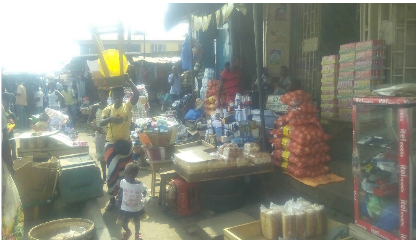
STREET VENDING IN SANI ABACHA STREET

In order to address this rapid upsurge in street vending in Freetown, the Freetown city council, ministries and other parties involved should try to build markets and create a database of vendors and also develop better ways of supporting and engaging vendors to understand their constraints and struggles. This can only be made achievable if we work collectively.