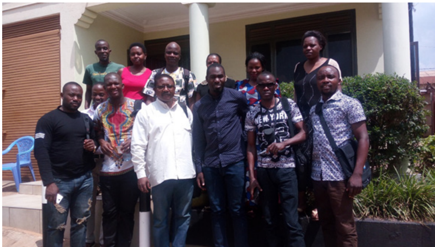
PSPP TEAM WITH HOST: EXECUTIVE DIRECTOR AND TEAM OF ACTOGETHER