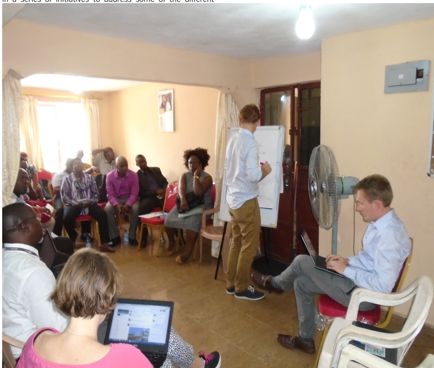
WORKSHOP SESSION WITH PARTICIPANTS DRAWN FROM DIFFERENT HUMANITARIAN ORGANISATIONS

While many organisations (state and non-state) consider that humanitarian response has a role to play in the empowerment of community organisations, exactly how this is done still remains a puzzle. Nevertheless, and as the Ebola crisis in Sierra Leone showed, community engagement can be critical in making humanitarian response efficacious. Community engagement did not only allow intervening organisations to tap from the tacit knowledge of community people, including their rich cultural values, but it also enabled the building of strong community leadership. It additionally allowed for the active role of communities in social mobilisation, at the same time as drawing from western ideas to deal with the crisis.