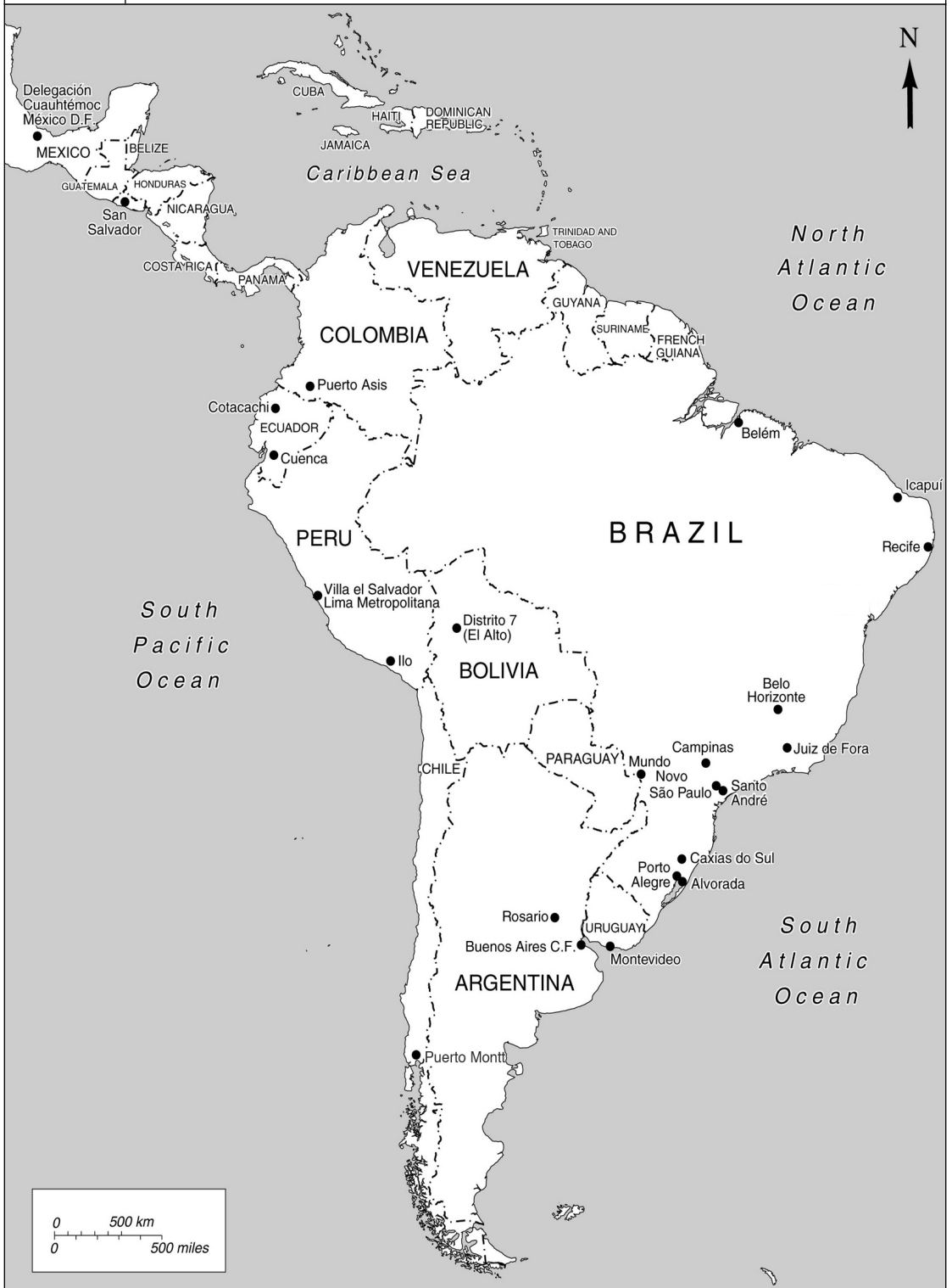
Figure 1: Case study locations in Latin America