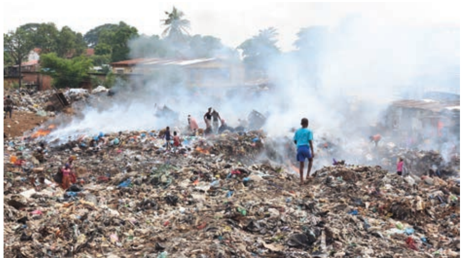
Photo 1: Waste pickers work amongst flaming trash at Kingtom landfill site. (Russillo, 2018)