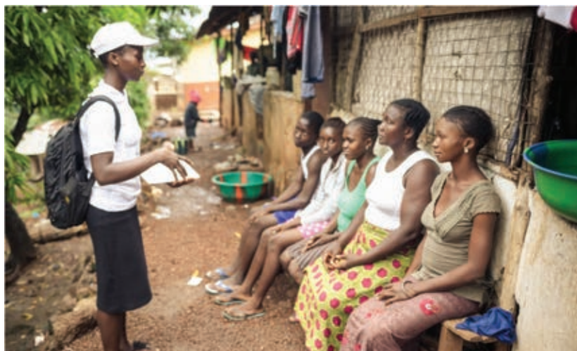
Photo 11: A healthworker in Dwarzack, Freetown, educating locals on sanitation methods. (Fox, 2017)

4. Education is crucial in building the local capacities of the residents of Freetown, by enabling the maintenance of proper waste management practices, independent of international aid. Through government incentives, programmes such as the Cleanest Zone Competition can be transformative in fostering community stewardship and waste management.