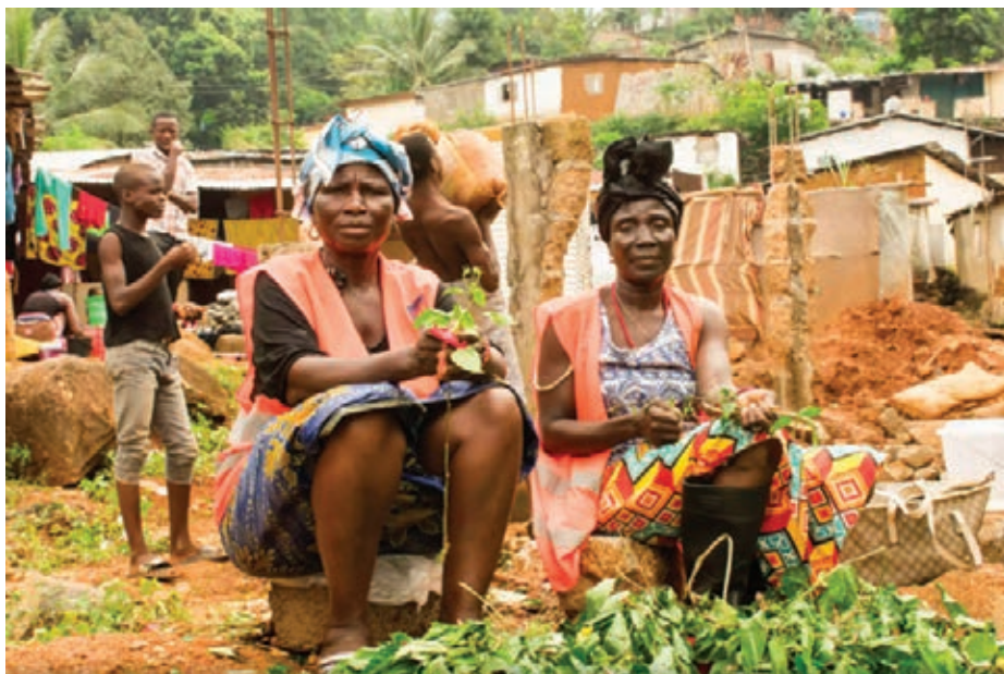
Photo 4: Women separate organic produce in their settlement to produce compost.