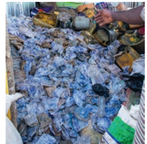
Photo 8: Plastic separation for recycling.

While the informal activities of waste pickers on the two official dumpsites is well documented, information on organised community-based organizations (CBOs) is lacking, despite their importance in coordinating waste management practices in Freetown. For example, the Culvert area has its own waste management committee. The above mentioned Klin Salone youth organization was able to implement waste management practices with the help of the Dumpsite Scavenger Association, a group of 25 waste pickers on Granville Brooke.