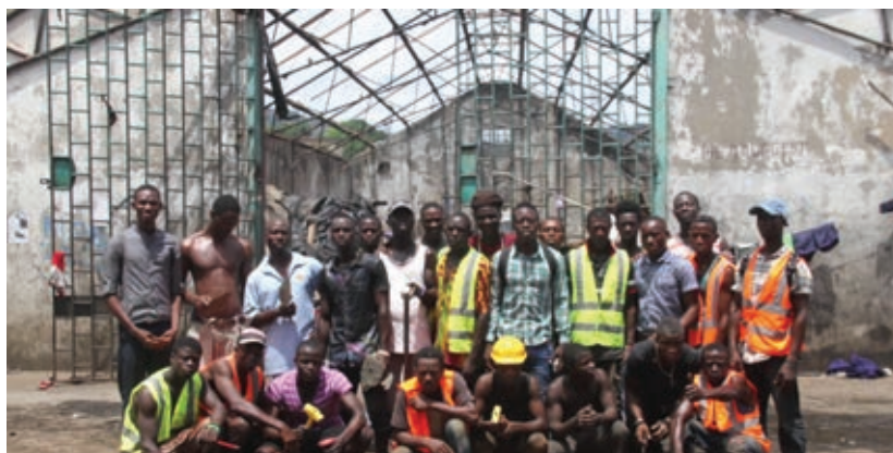
Photo 10: Le Plastics working on a new warehouse in Kingtom landfill site. (Le Plastics, 2018)

2. Supporting recycling programs such as Le Plastics, an initiative that is currently distributing bins to homes and other start-ups for plastic-only collection is recommended. This could increase efficiency in waste collection and ease the burden on informal waste pickers. In addition, the processing of bio-degradable (organic) materials – food waste, cardboard, paper – could significantly reduce waste accumulation and further upgrade composting.