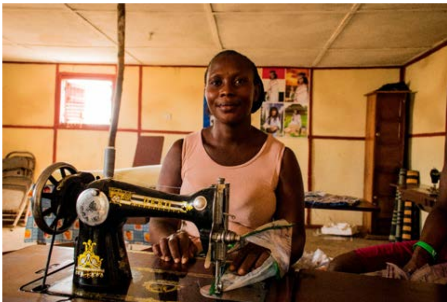
Photo 3: A woman in Freetown makes bags from recycled plastic. (Conteh, 2018)

Composting is an efficient waste management strategy as it is cheap and environmentally sustainable. Although most solid waste generated is organic (70%), official composting capabilities in Freetown are poor (Abarca and de Vreede, 2013). To reuse and contain this would be a significant step forward in the reduction of waste accumulation. However, composting is limited to two drying beds for liquid waste located within the Kingtom landfill site. These were built in 1994, no longer function properly, and when used leak refuse into the surrounding areas (Preneta, 2015).