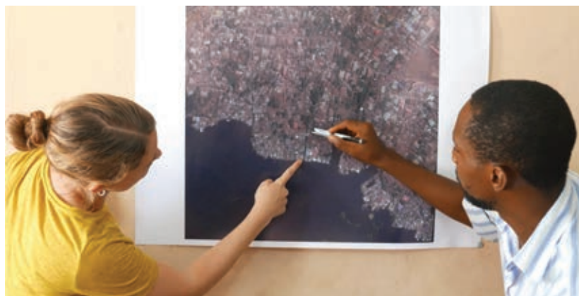
Photo 9: Participatory mapping in Freetown as a data-collection method. (SLURC, 2017)

1. Strategic intervention is required to upgrade current infrastructure of official waste collection system. Improving road networks and adjusting skips and dumpsite locations could significantly contribute to a more spatially just and efficient flow of waste. Also, participatory mapping could serve as a tool to collect more accurate data on waste generation and flow, and this information can be used for future planning.