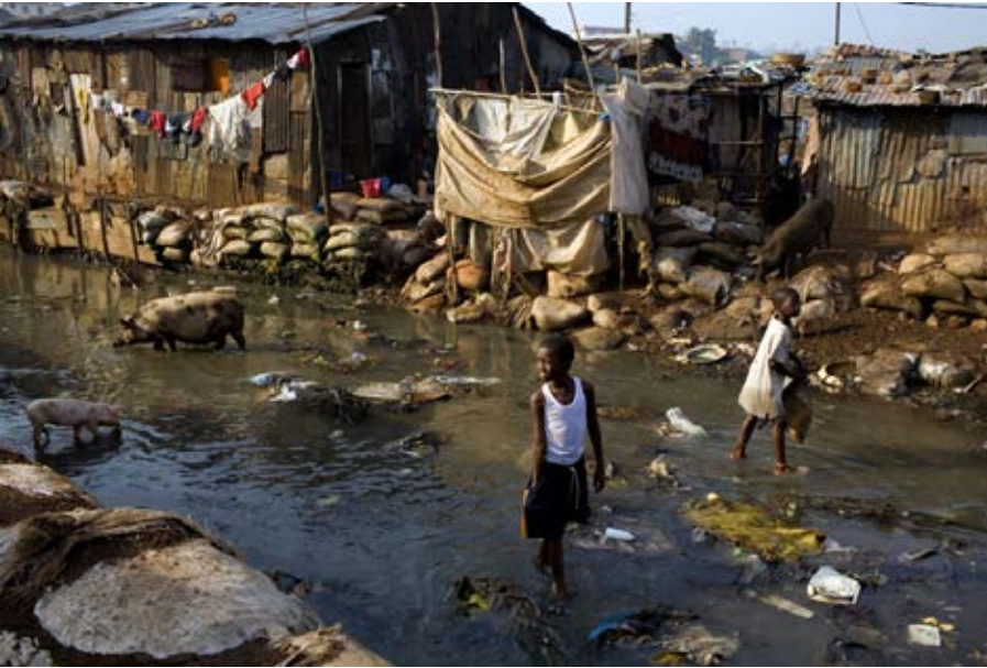
Photo 5: Boys walk in a river to collect scrap metal in Kroo Bay, Freetown. (Kari, 2017)

Informal waste management practices exist across Freetown in a variety of forms. They replace lacking formal policies and collectively contribute significantly to an informal economy. Firstly, there are numerous recycling practices by individuals across Freetown that mirror the UNDP projects. Plastic is collected as a valuable resource and transformed into new products. In Cockle Bay, women go door to door to buy plastic waste and weave it into useful accessories such as bags and hats (Roussos, 2015).