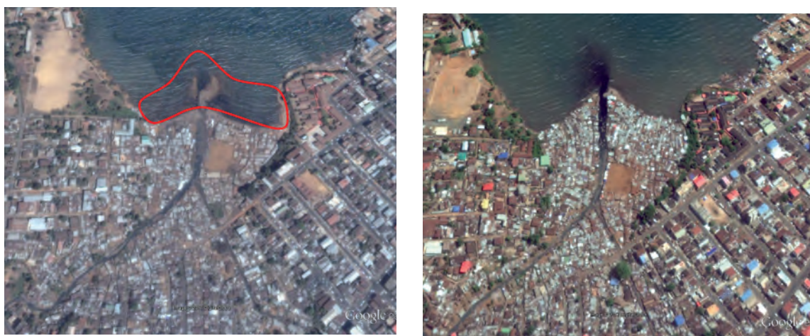
Fig 4a: Encroachment of wetlands in Konga town. Left 2006, right 2017

lated with topography, geological structures, rainfall intensity and duration, impact the flow of debris mostly in the densely populated northern part of Freetown where two streams meet (Regent, Kanigo, New England, Kissy brook, Congo town, Madongo Town).[12]