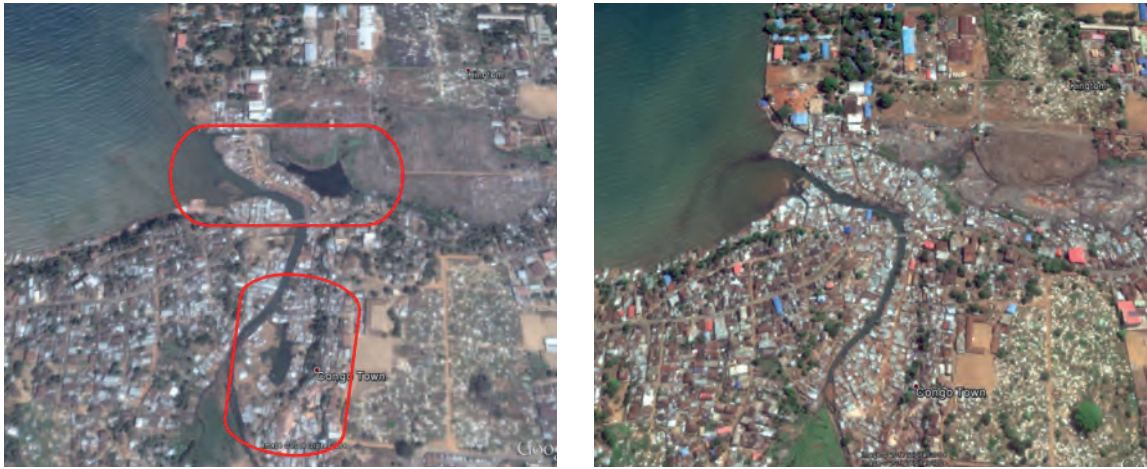
Fig 4b: Land reclamation in Kroo Bay over time. Left 2006, right 2017

The occurrence of the various types of floods have been mapped in