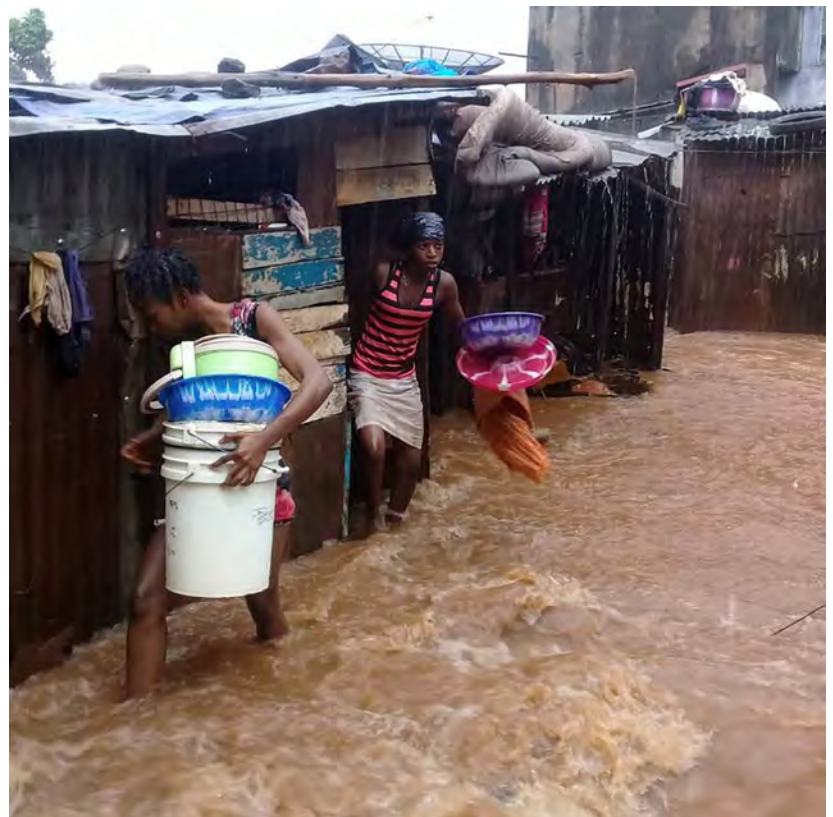
Fig 6: Women Evacuating Flooded Homes in Regent, Freetown in 2017