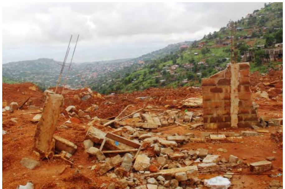
Fig 1: The ruins of buildings from the aftermaths of the mudslide in the Regent area, on the slopes of Sugarloaf Mountain Freetown, Sierra Leone, September 21, 2017.