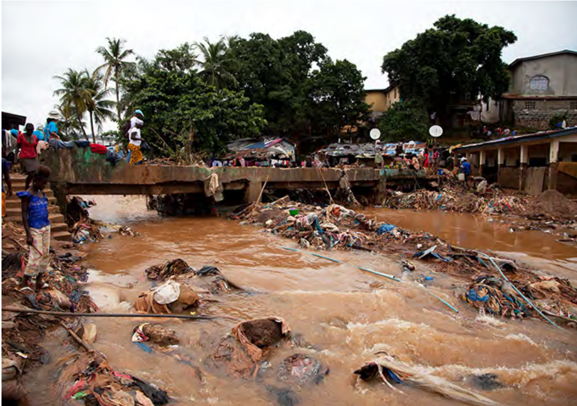
Fig 2: Abundance of Waste in Freetown due to overstretched infrastructure and limited services . Photo Credit: Crisis Response [7]

led to drastic land cover changes which are themselves exacerbating the risk of floods and mudslides[5]. These include land reclamation, ecosystem degradation, deforestation, mangrove destruction and the alteration of river flows. These activities, directly impacting Freetown's microclimate, intensify the effects of climate change in the region, thus exacerbating the frequency and intensity of local rainfall.[6]