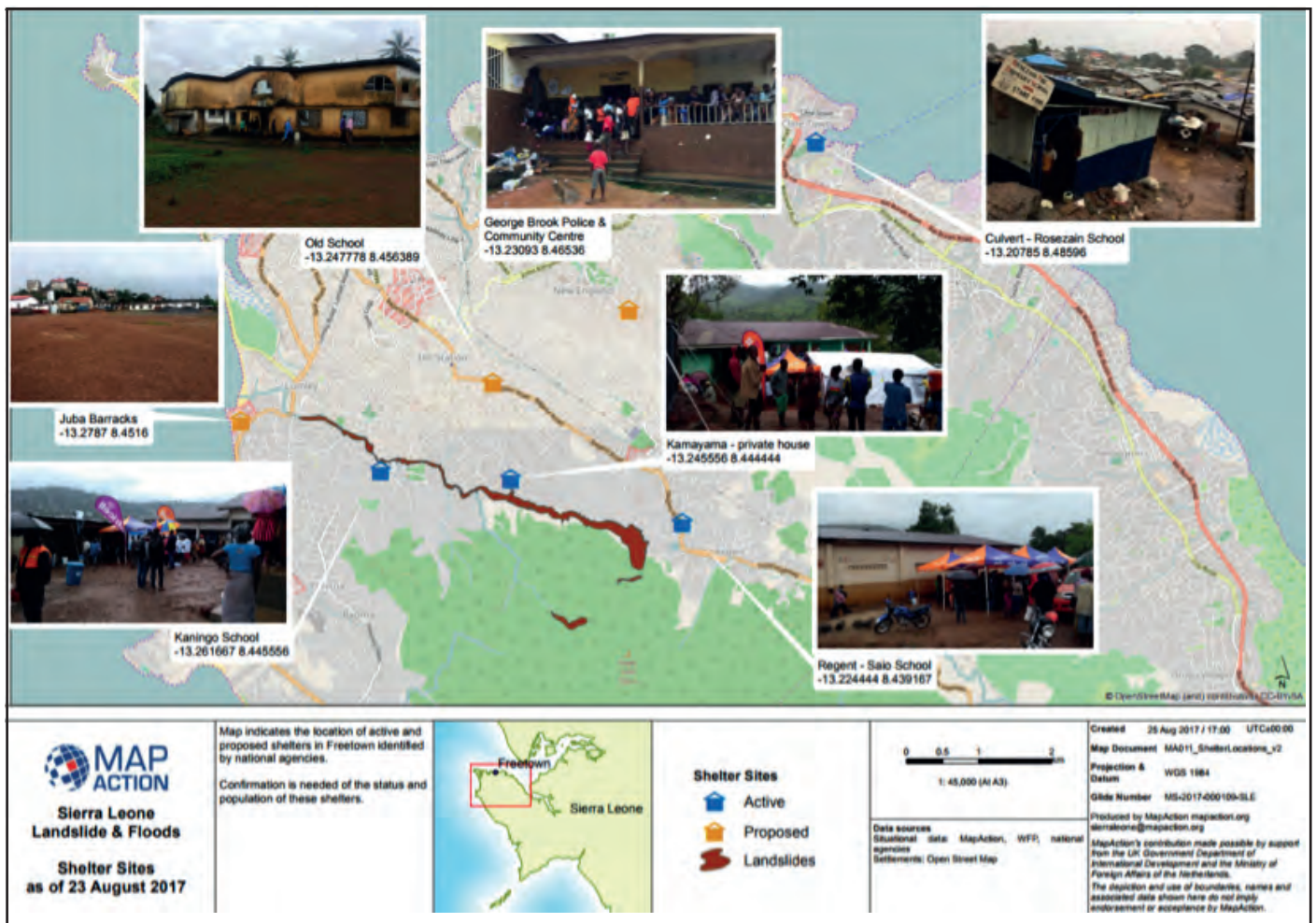
Fig 8: Shelter Sites after the Regent Mudslide, 23 rd August 2017

the UNDP provides the example of how communities built into the mountain side reinforce retention walls to help keep water out of their homes. This is a short-sighted solution considering it intensifies the amount and force of the water, 'which then spills into and floods other communities, further downhill'.[2] Other coping practices include transferring valuables to high up shelves and beds, only reachable by climbing a ladder.[10] Yet again demonstrating a far from sufficient protection from the devastating intensity of floods and mudslides in Freetown.