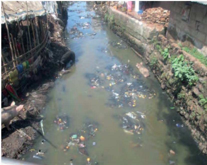
Fig 3: Poor sanitation in drainage.

The overall risks associated with these natural disasters are varied and include death, disease and damage to households and possessions. However, apart from these initial consequences, other cascading risks appear such as the heavy flow of waste and debris (including faecal sludge), leading to the destruction of households and the possible contamination of water sources, which may in turn, bring about health risks and waterborne diseases, and the disruption of services, the use of manpower to provide relief (forcing people to take time off from work), income loss and the pollution of coastal waters impacting local ecosystems, fishing and thus the local economy.