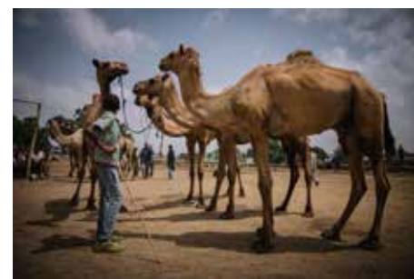
Top: Afar pastoralists.