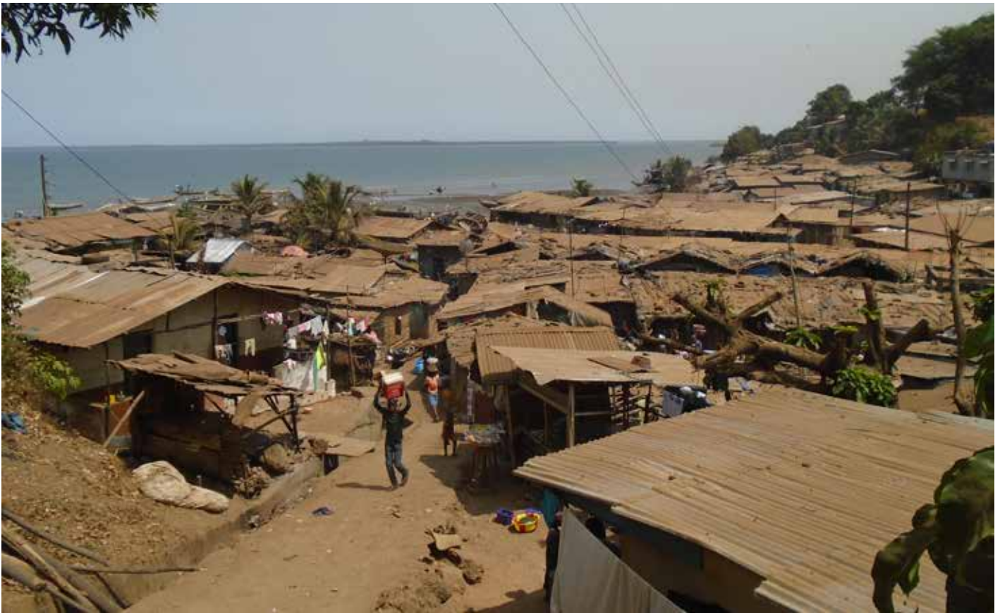
Above: Cockle Bay settlement.

gaps identified, we asked ourselves what the legacy of such a project would be. This prompted discussions with Njala University, the leading academic institution in Sierra Leone, after which a case was made to Comic Relief about the need for a larger investment. The project proposed to establish a research institution to build research capacity of urban professionals and communities in Sierra Leone, to set a locally-relevant research agenda, to deliver high quality research in partnership with others, to disseminate research outputs, and to work in partnership with urban actors to advocate for urban justice.