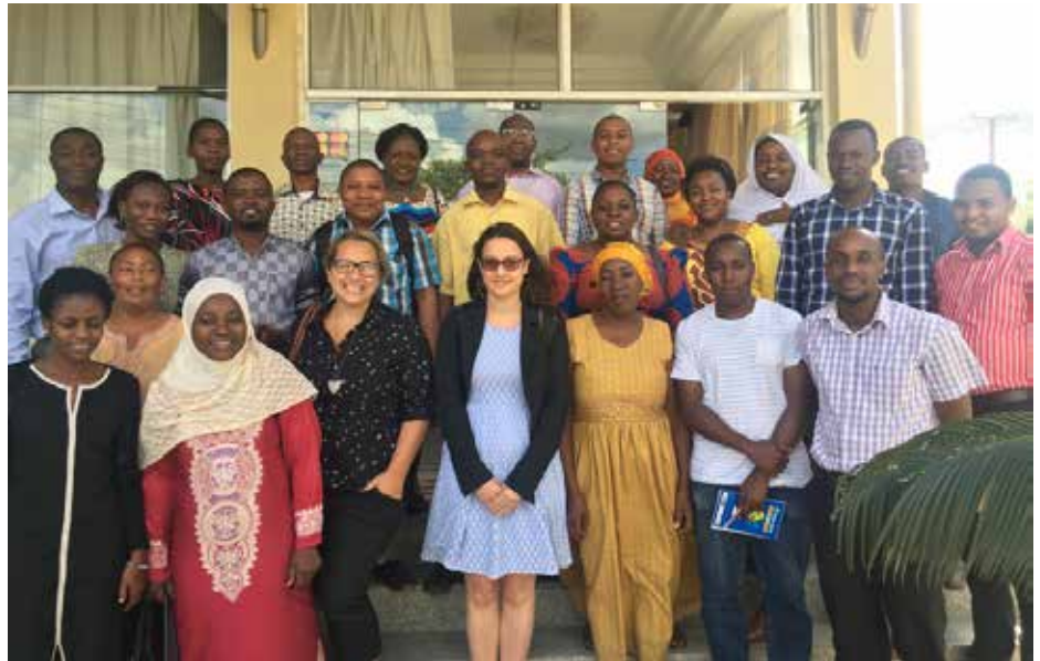
Above: Participants of the Action Planning Workshop, Dar es Salaam.