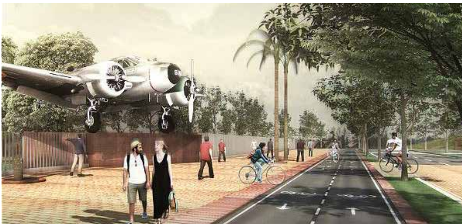
Above: Artist's impression of the Corredor Verde.

In all, the workshop stimulated a healthy discussion, including a list of short- and long-term priority action points about what measurements should be used to show the realities of risks low-income people face in a way that is practical and straightforward, so that policy-makers can take action. Participants also discussed communication channels that could be leveraged in order to ensure that community voices feed into policy formulation.