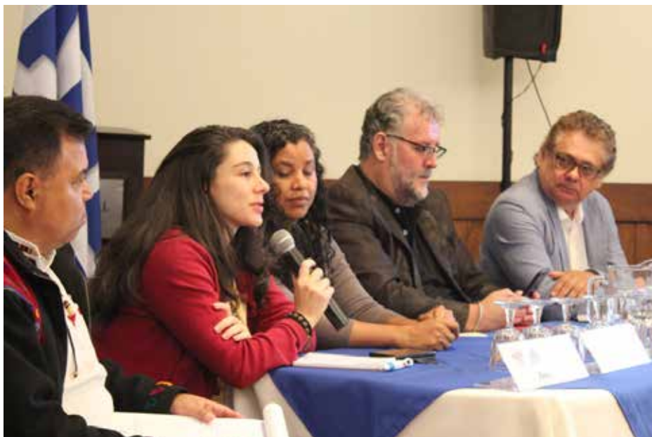
Above left: Local activists denouncing expansion of monocultures (particularly pineapple for exports) in Costa Rica.

the annual short video competition and the winners of WATERLAT's prizes to the best doctoral and master thesis; a very successful initiative of the network. As has become a tradition, the meeting closed with a public conversation, which in its plenary session approved a general declaration and four specific declarations for Colombia, Brazil, Mexico, and the host country. The