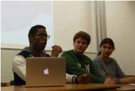
Above: 'Tanzanian Government' announces plans at a contentious press conference.

simulation to keep the participants grounded but also to ensure that portrayals are realistic and respectful of their real-life counterparts.