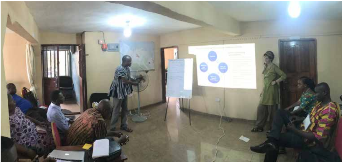
..... Top: A workshop participant presenting a group strategic action plan.