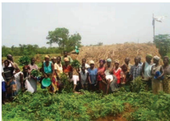
Figure 5. The female farmer association in Freetown

The importance of UPA and food security has already been recognised in both national and local policy frameworks for development, providing a good basis for policymakers. The Wetlands Policy of 1970 reserved all state-owned wetlands for farming. 6 In line with this, FCC has established urban agriculture as one of its key productivity sectors, and designated two wetland zones as areas for urban farming in its land use plans. 13 Moreover, it has actively worked with NGOs in the past, for example by supporting the Resource Centres for Urban Agriculture and Food Security (RUAF) and Cooperazione Internazionale (COOPI) in establishing the Freetown Urban and Peri-Urban Action Platform (FUPAP) in 2006. FUPAP is a multi-stakeholder platform including NGOs, national and local government representatives as well as farming associations. It provided a vital network for communication between farmers and government institutions; however, it has not met since 2013. 6 If provided with active platforms for communication and engagement, these initiatives have the potential to engage urban farming communities and create transformative change to mitigate occupational hazards. 14