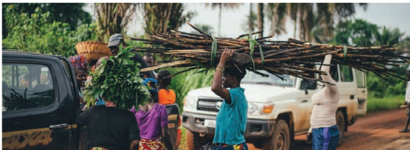
Figure 2. Female farmers carrying crops for distribution.

The physical hazards in UPA mostly concern physical injury and wounds due to heavy manual labour in the cultivation stage. These hazards tend to disproportionately affect female farmers. One of the key concerns for women is the difficulty of securing and transporting large quantities of water in order to irrigate their farms. Many women do not own watering cans and have to use small buckets and bowls for watering, which requires multiple trips to fetch water, therefore contributing to physical stress over time and increasing the risk of injury. These risks become particularly severe during the dry season, when nearby boreholes may dry up and fill with sediment and pollutants. In these cases, farmers must either risk using contaminated water, or travel even further to find an unpolluted water source. 11