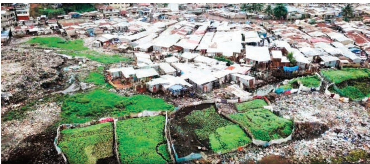
Figure 1. Urban farms in the Kingtom area situated on dumpsites