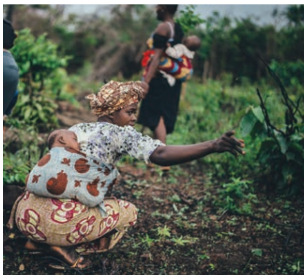
Figure 3. Women are responsible for multi-tasking in the household including caring for children and farming.

Studies have found that the vast majority of female farmers in Freetown use income from farming for essential family needs, while men are more likely to see urban farming as an entrepreneurial opportunity. 11 The pressure of balancing various household and economic needs means that women are less likely to have income or time to invest in measures to mitigate the physical hazards presented by manual labour (See Figure 2 & 3). Many banks in Sierra Leone do not provide loans for illiterate people: given the significant gender gap in literacy rates (41.33% for men, 24.86% for women), this suggests that women are disproportionately cut off from sources of credit through which they could make their working environments safer. 12