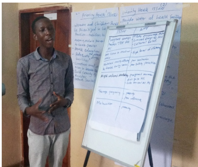
Participant presenting thought from group discussions