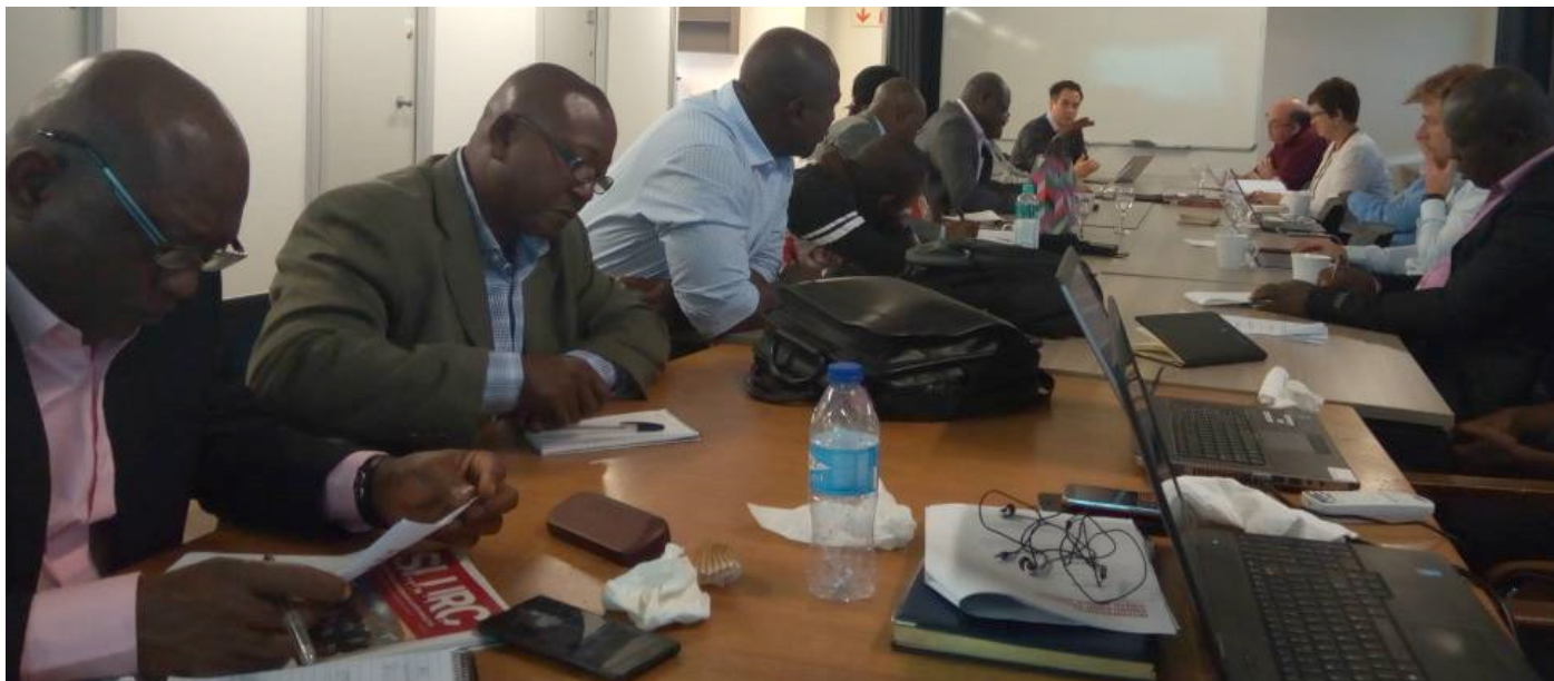
Participants engaged in discussions with management and staff of the African Centre for Cities (ACC) at the University of Cape Town; 24 October 2017.

Recent mudslides in Freetown and, in particular, that in the suburb of Regent which resulted in the loss of over 500 lives and the displacement of more than 3,000 people, have highlighted the urgency of risk reduction in Freetown.