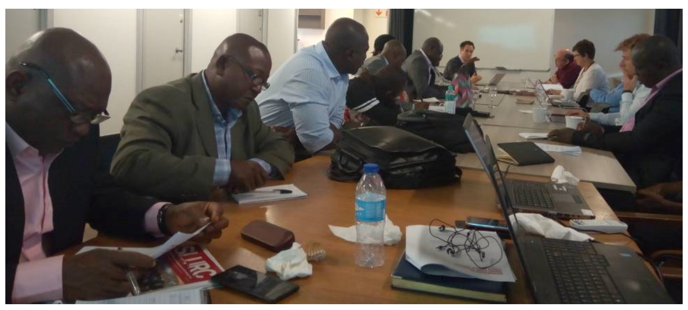
Participants engaged in discussions with management and staff of the African Centre for Cities (ACC) at the University of Cape Town; 24 October 2017.

Recent mudslides in Freetown and, in particular, that in the suburb of Regent which resulted in the loss of over 500 lives and the displacement of more than 3,000 people, have highlighted the urgency of risk reduction in Freetown.