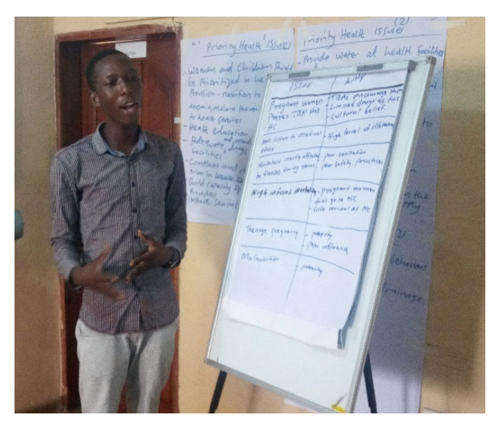
Participant presenting thought from group discussions