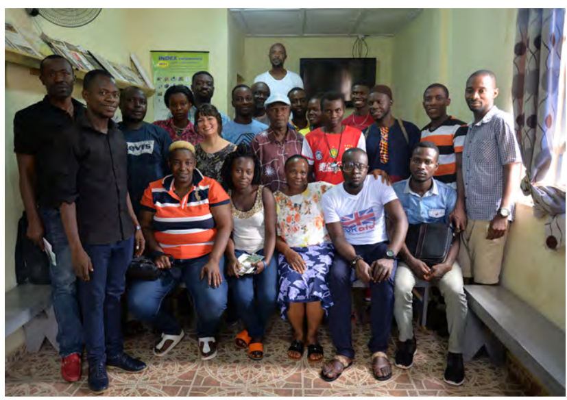
Inclusive Community Learning Platforms: Meetings in Cockle Bay (Top) and Dworzark (Bottom). Pictures by Camila Cociña, June 2019.