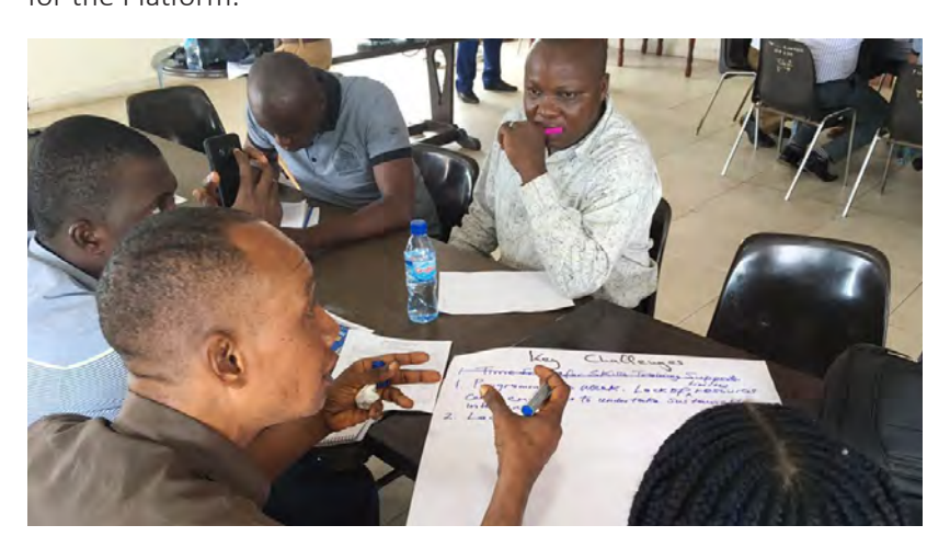
Mutual respect and trusted relationship: City Learning Platform discussions in September 2019.

Finally, this platform is seen as a key space to connect different stakeholders in the city, and to establish a level playing field for actors with different knowledges, responsibilities, or authorities to come together. As there is a diversity of participants involved in the process—from national and local government authorities, local communities, private sector, academia and civil society organisations—this requires mutual respect in interactions, with space for varied views and opinions to be expressed. While recognizing that not all participants will start from a position of trust, the Platform is understood as a vehicle to build such relationships . This requires an approach to discussion and facilitation which ensures non-judgemental participation, respect, and confidentiality. Therefore, apart from the interventions and collective projects which may emerge from its members, building and enhancing respect and trust is also understood to be a clear and important legacy for the Platform.