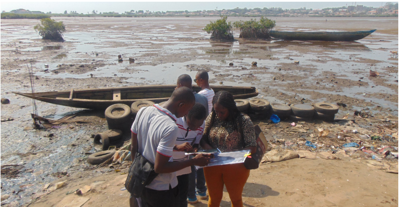
Data collection in Cockle Bay.

Meanwhile, SLURC joined other international KNOW partners in Havana, Cuba at the end of February for the second international dialogues in urban equality meeting, discussing the translation of knowledge into action.