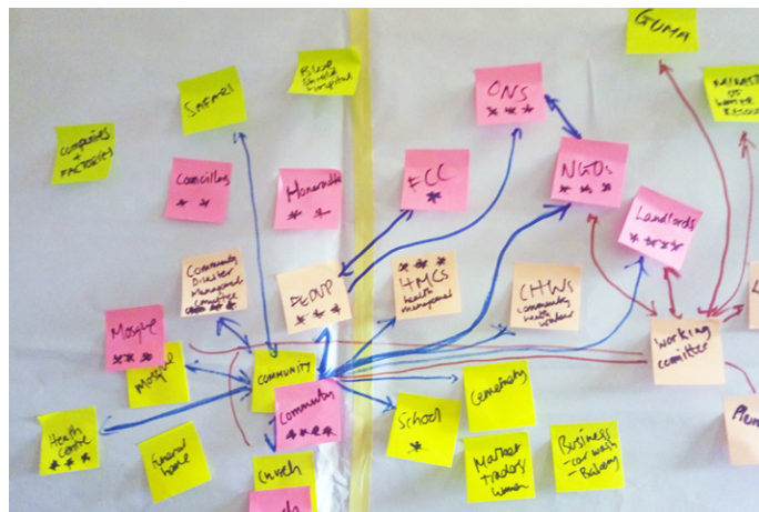
Network map in CKG.

1 Crab town, Kolleh town and Grey bush communities are adjacent communities in the centre of Freetown, while Moyiba is located on the hills in the far east of the city