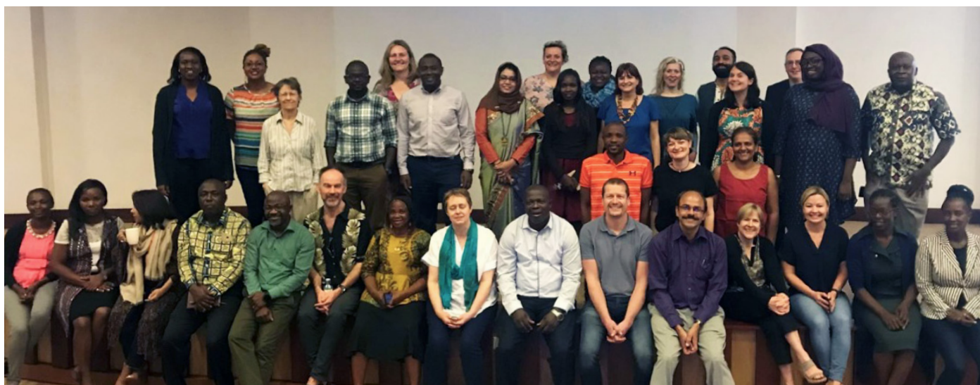
ARISE partners gathering in Nairobi for the inception meeting.

Lack of accountability emerged as a significant barrier to people in Freetown's informal settlements accessing their right to healthcare, during SLURC's Future Health Systems research. SLURC is excited to be part of UK Research and Innovation (UKRI)'s ARISE: Accountability for Informal Urban Equity Hub, an interdisciplinary global research Hub funded through the UK Global Challenges Research Fund (GCRF), focussing on health. ARISE brings together 10 partners to support marginalised, precarious people in informal settlements across Sierra Leone, Kenya, Bangladesh and India to claim their right to health.