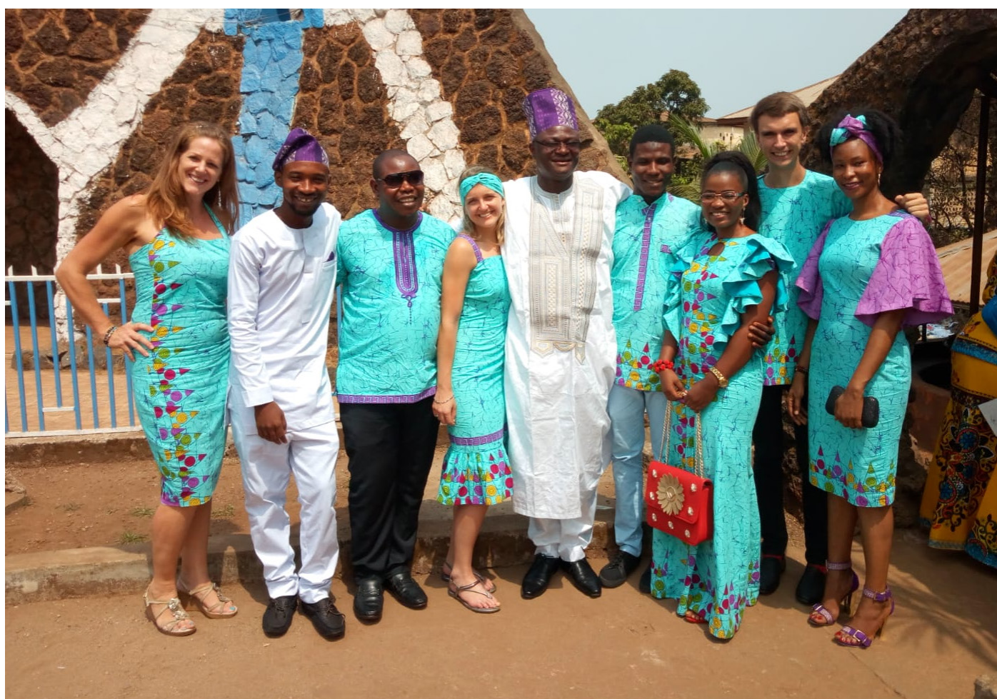
Some of the SLURC team in their wedding ashobe.