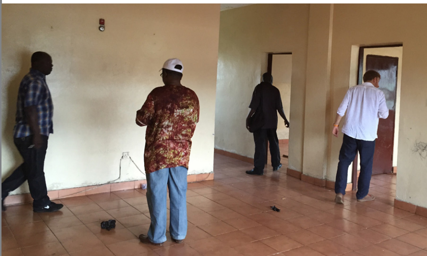
Looking for office space in Freetown during the very early days of SLURC.

SLURC has been an integral participant at three recent international meetings - in Nairobi on urban health (see page 2), in Havana on urban equity (page 3) and in London on sustainable urban mobility (page 5); alongside important stakeholders from around the globe.