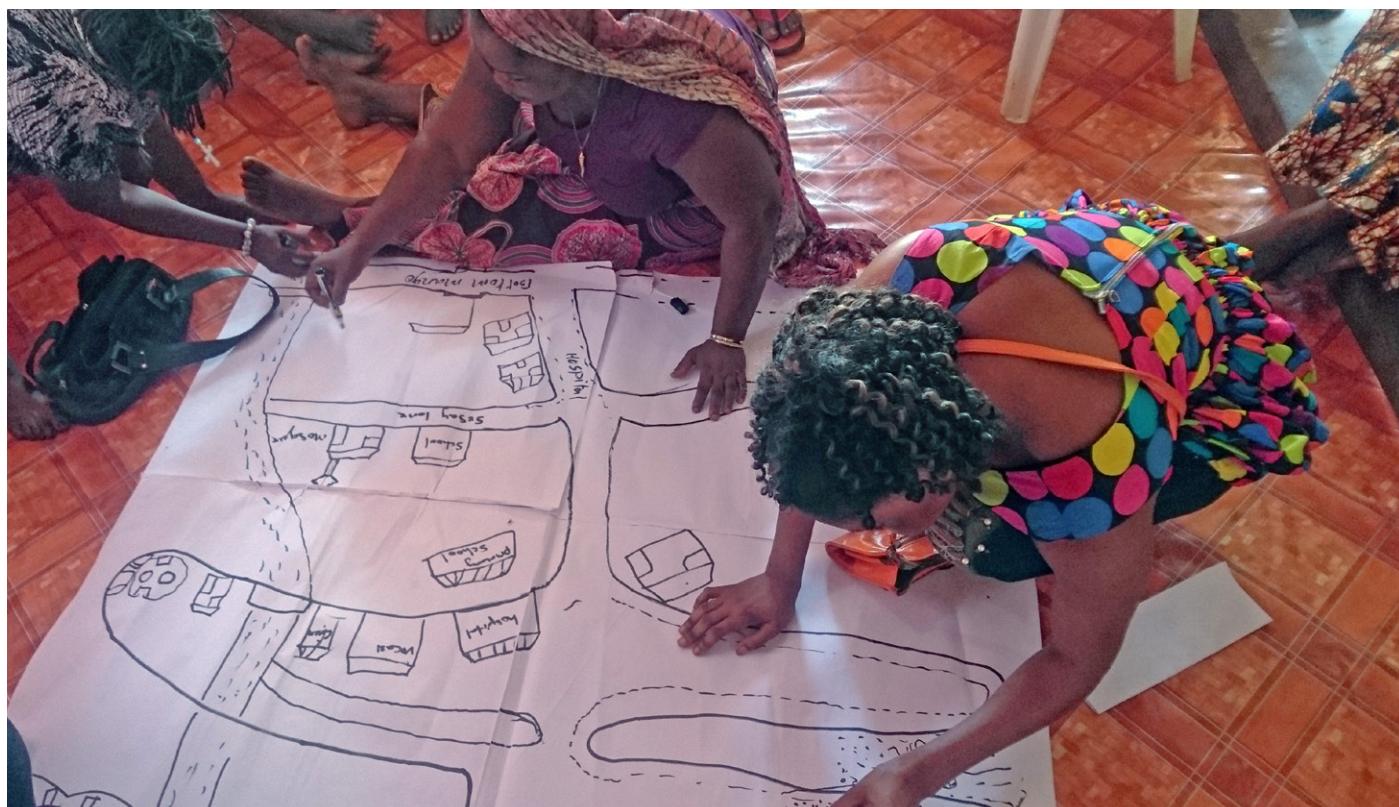
Community mapping of disease hotspots in Moyiba.

Ultimately the research aims to strengthen infection control and community health systems, therefore contributing to epidemic preparedness in urban areas. The programme is based on the belief that in order to implement infectious disease control programmes which are relevant to local contexts and are based on meaningful community participation, it is necessary to take local logics and concepts of disease into account and to identify and build on existing preventive practice.