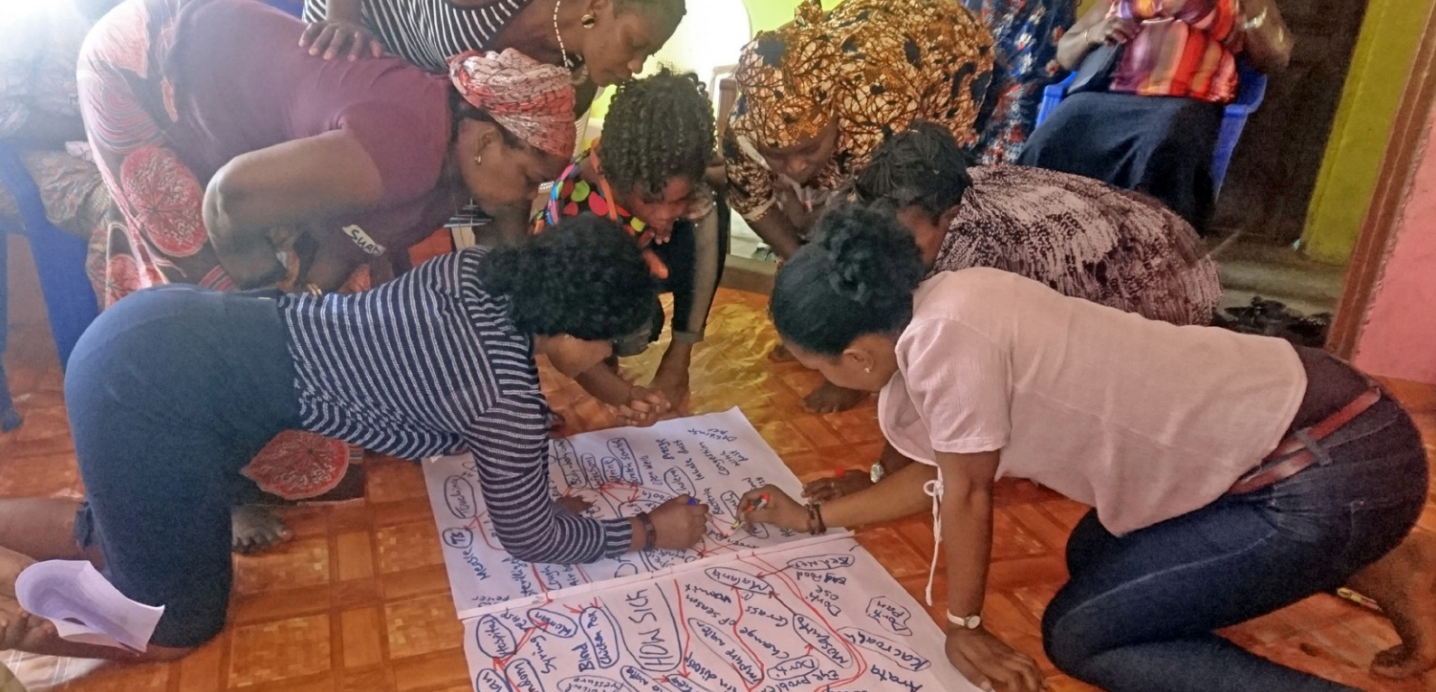
Community members linking diseases and other factors in Moyiba informal settlement.