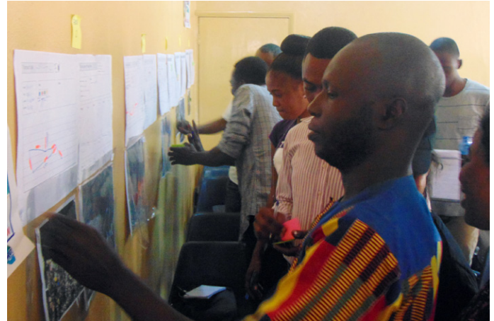
Developing and testing the tools.

A range of participatory tools were introduced, including transect walks, mapping, timelines, photo diary and ranking/prioritising. The tools combine manual and digital techniques to reveal the diverse needs and aspirations of the communities in which they are used. These were further developed and tested by participants in the field. Participants also developed a code of conduct, and considered effective methods for data management.