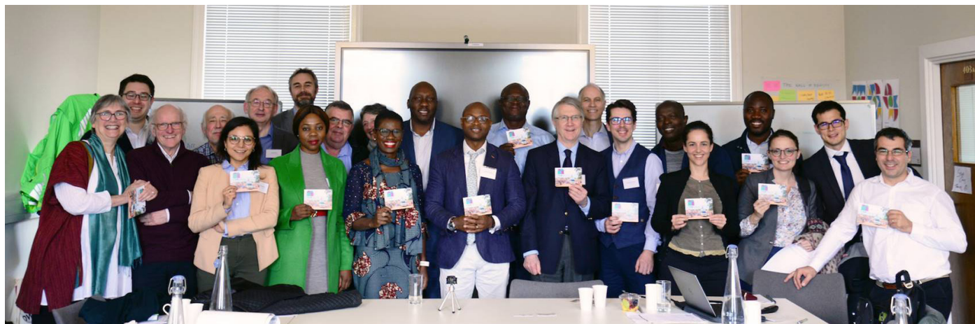
T-SUM international partners at the first international meeting in London.

As cities in the global south - and especially sub Saharan Africa - grow, an important challenge they face is ensuring that growth pathways support the implementation of sustainable mobility, as opposed to rising motorization and its associated social and spatial inequalities.