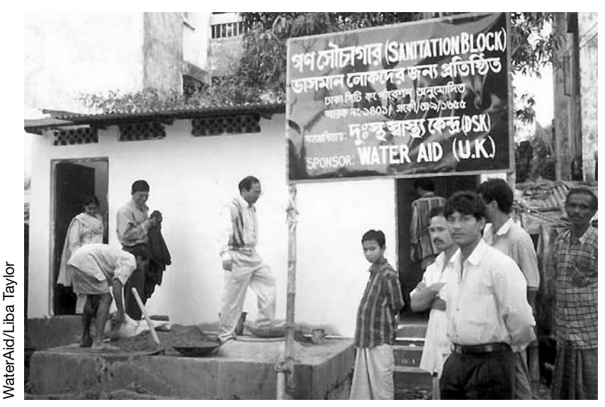
Photo 2: Sanitation blocks, which include latrine stalls, urinals and bathing space, are designed to serve up to 500 people