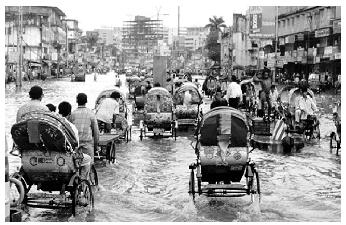
Photo 1: Flooding in Dhaka causes widespread disruption to city life.