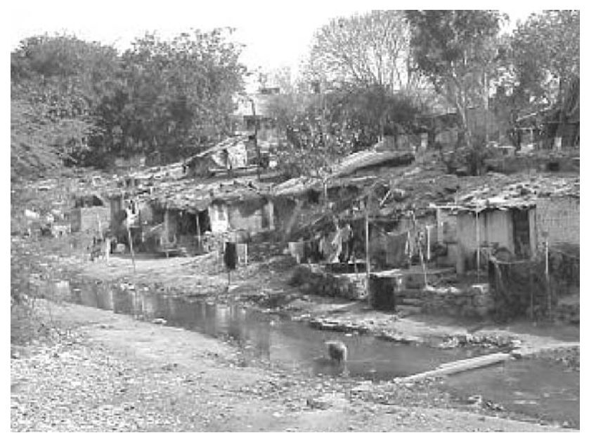
Photo 2: Slum settlement living adjacent to a polluted drainage channel in Lucknow, India. Blocked, polluted drains like this one in Lucknow are important breeding sites for Culex quinquefasciatus mosquitoes. Low-income communities living in slums next to drainage channels are especially susceptible to environment health problems as well as those related to flooding.

related to drainage conditions are Aedes mosquitoes, which transmit yellow fever, dengue and dengue haemorrhagic fever. These mosquitoes often breed in containers which fill with water during rain, such as domestic water storage containers, discarded cans, tyres, plastic bags and coconut shells. Anopheles mosquitoes, which transmit malaria, are also a risk in urban areas, and they lay their eggs in still, unpolluted water, for instance in wetlands and on pond surface waters, which are commonly found where drainage is poor.<sup>(9)</sup>