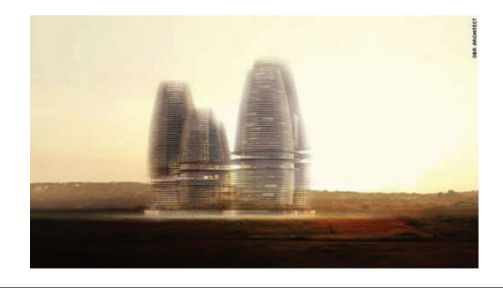
FIGURE 4 Hope City, Accra

20. http://mg.co.za/ article/2012-11-23-00-angolantrophy-city-a-ghost-town, accessed 5 July 2013.