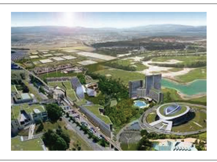
FIGURE 3 Konza Techno City, Nairobi

NOTE: Graphics developed by Pell Frischmann (http://www.pellfrischmann.com/search.php?query=Konza+City&x=10&y=11).