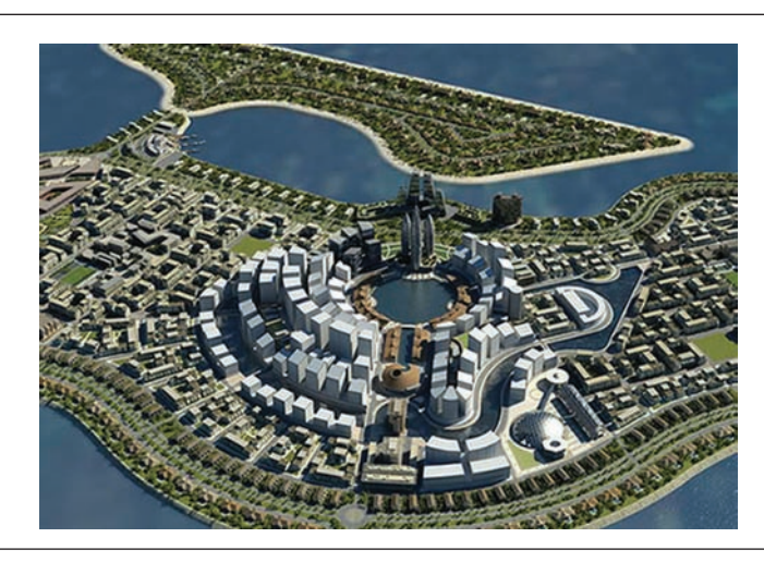
FIGURE 6 Kinshasa: Cité le Fleuve

NOTE: Plan/graphics developed by Hawkwood Properties (http://www.lacitedufleuve.com/aboutus.php). The major shareholder is Mukwa Investment (http://www.hedgeweek.com/2007/01/19/hedgeweek-interview-hillary-duckworth-chief-investment-officer-mukwa-fund-unearthing-oppo).