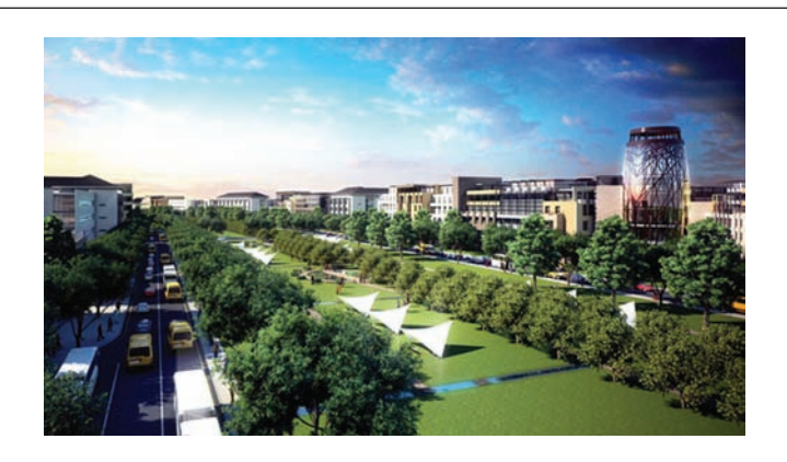
FIGURE 2 Tatu City, Nairobi

NOTE: Plan/graphics developed by Rendeavor (Renaissance Group) (http://www.rengroup.com/UrbanDevelopments).